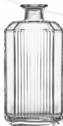
SIRIUS VINTAGE 700 ml