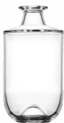
LYRA 200 ml, 500 ml, 700 ml