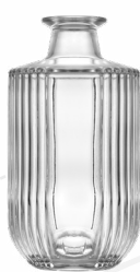
LYRA VINTAGE 500 ml, 700 ml