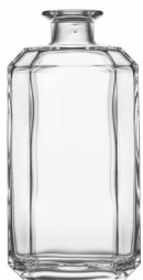
SIRIUS 50 ml, 500 ml, 700 ml